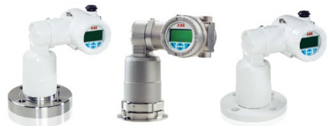
ABB lasers read silo levels without being affected by these factors, providing inventory measurement or process control without adjustment or maintenance.

Vessel build-ups and constant profile changes occurring within silo walls constitute an issue for many level measurement technologies.