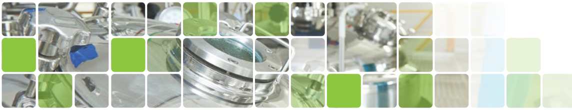
ABB RECORDING & CONTROL APPLICATION