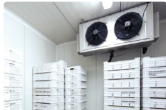
ABB have a variety of recorders capable of recording temperature at whatever time intervals are required by the customer. The data is stored for analysis and can be easily downloaded to a USB memory stick/SD card for archiving or transfer to a PC.

The obligation to monitor can also extend to areas that are used for food preparation. An example of this is an area used for preparing meat and fish, where products must be weighed, prepared and packed at temperatures of around 7°C (45°F). It is also normal to monitor and record ambient storage conditions in these areas.